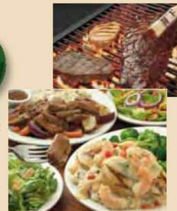
Stacked Chicken & Shrimp